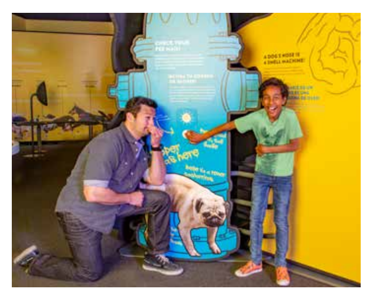
Smell Like a Dog Sniff a model tree, human, and fire hydrant. Can you glean as much information from smell as dogs do?