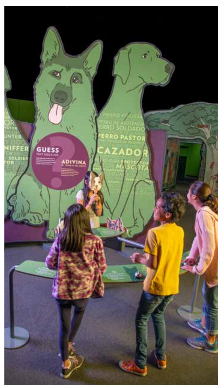
Guess That Dog's Job Pretend to be a working dog and read out clues about your career. Can your friends guess your doggy job?