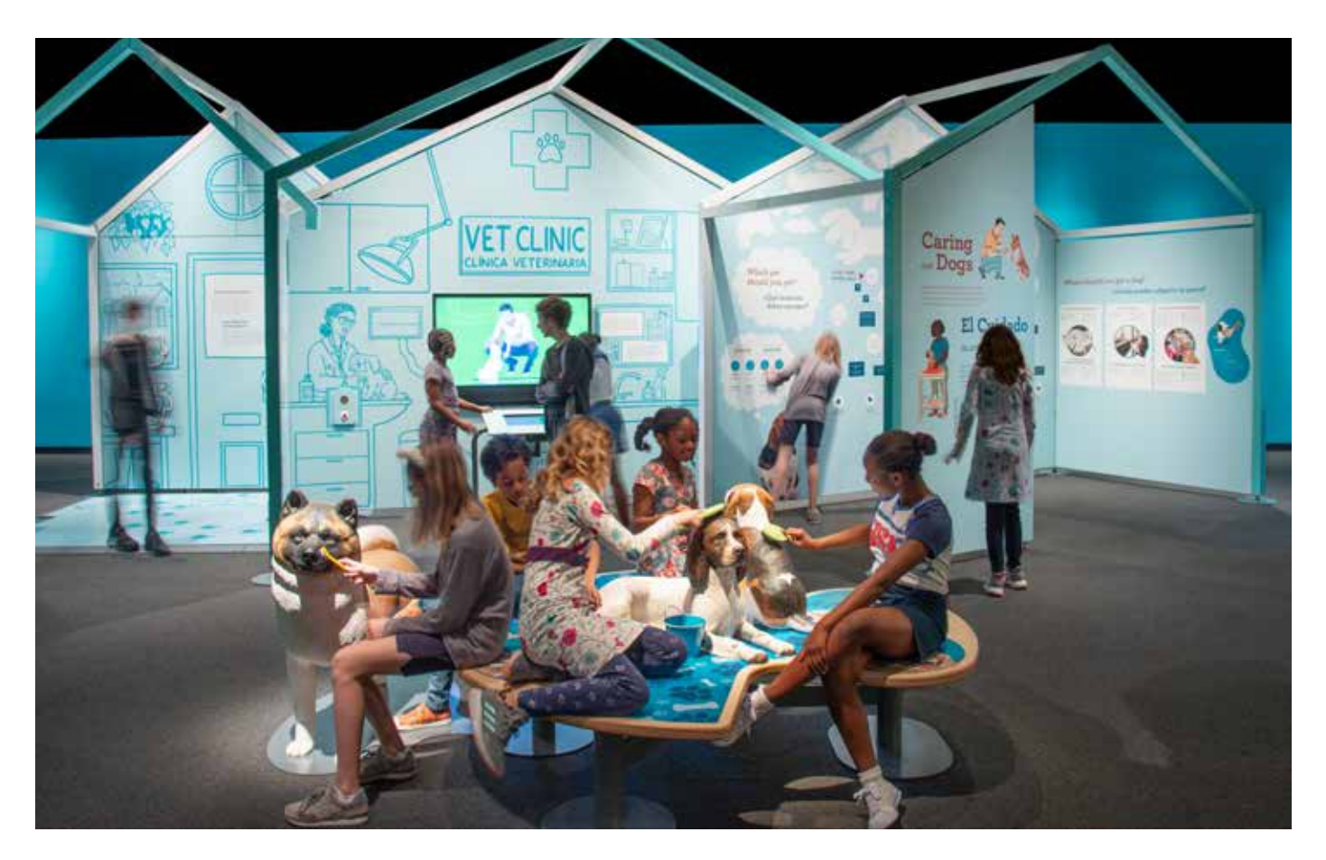
Dog Models – Care Practice your grooming skills on these life-size, touchable and brushable dog models. Or pose for selfies!