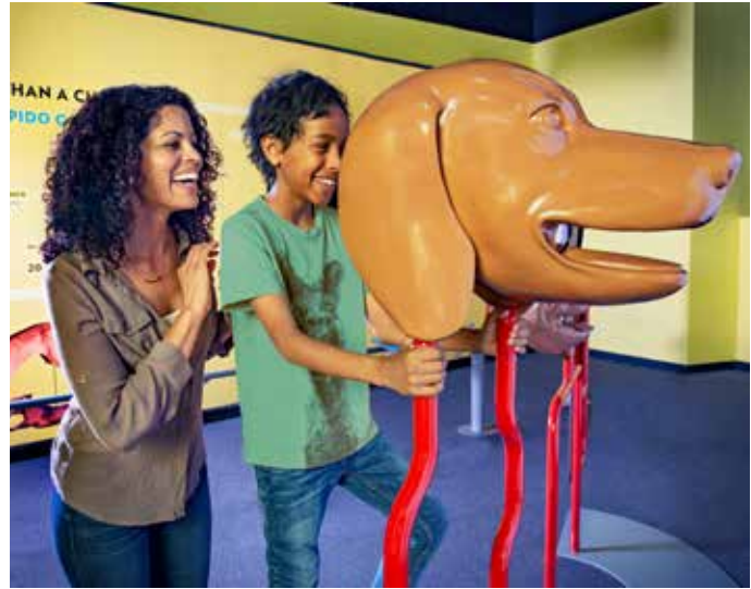
See Like a Dog Peer through giant dog heads fitted with special filters to see how the world looks to a dog.